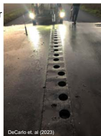
DeCarlo et. al (2023)